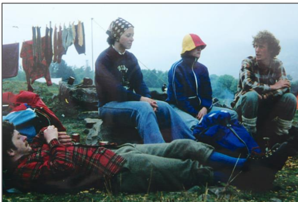
The 1970s – the decade of happy campers and plaid shirts